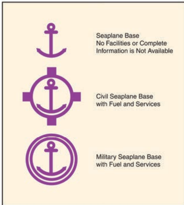
Figure 1-2. Seaplane landing areas have distinctive symbols to distinguish them from land airports.

shown on nautical charts prepared by the Office of Coast Survey (OCS), an office within the National Oceanic and Atmospheric Administration (NOAA). Light lists prepared by the Coast Guard describe lightships, lighthouses, buoys, and daybeacons maintained on all navigable waters of the United States.