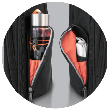
Multifunctional side pockets with water bottle loop