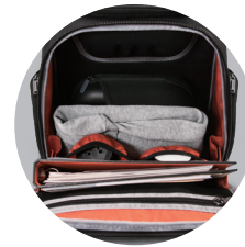
Ample storage space