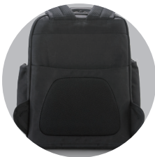
Ergonomic padded back panel