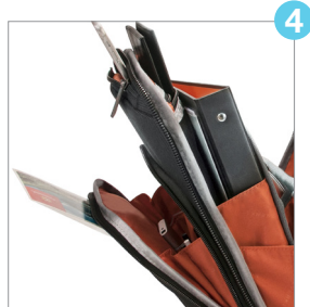
Front-loading quick-access file divider