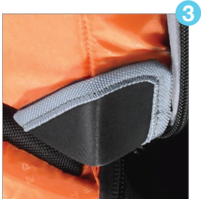
Patented corner-guard protection system