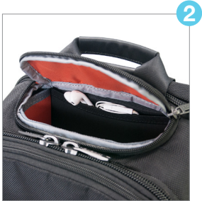
Hard-shell quick-access sunglasses case