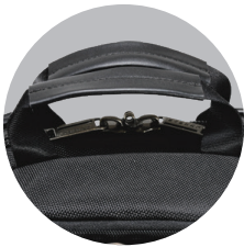
Premium leather handles and accents