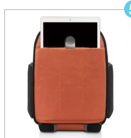
Felt-lined iPad/Kindle/tablet pocket