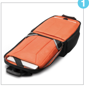
Travel friendly 14.1-inch laptop/MacBook Pro 15 compartment