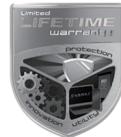
Limited Lifetime Warranty protection