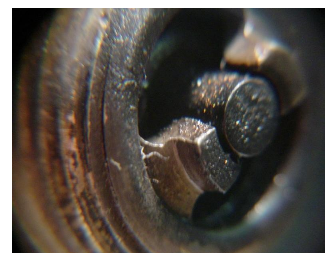
FIGURE 2 COPPER DEPOSITS ON ELECTRODES