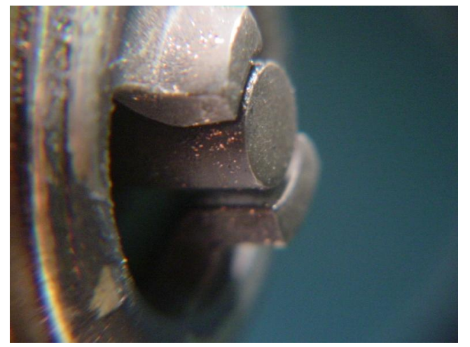
FIGURE 4 COPPER DEPOSITS ON ELECTRODES