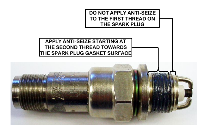
FIGURE 1 ANTI-SEIZE APPLICATION